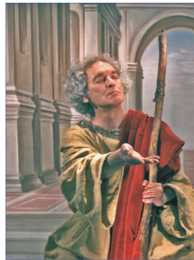
Photographic setup with holotrack camera for the blind Bard hologram for Muzieum.

Up till now photographers are making the most beautiful two dimensional pictures and holographers make sparkling three dimensional pictures, called holograms. DHL offers photographers for the first time the possibility to make 3D holograms also, without the skills of a holographer.